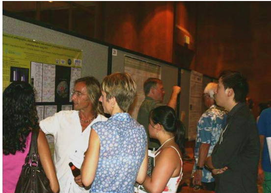
Researchers explaining their research