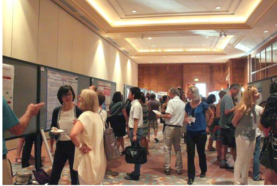
Poster session of the Annual Meeting