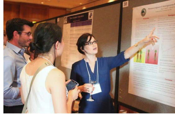
Researchers explaining their research